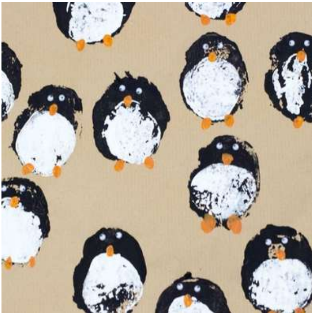
Potato Print Penguins

See below some good examples of handmade cards that could inspire your own design.