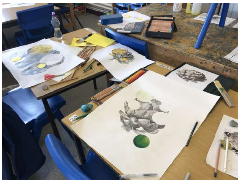
Year 11 Art Exam - Students produced outstanding work during this exam that for many students was well above their tracked grades - a very successful 2 days for all.

Art enrichment students created a beautiful installation of wire and tissue paper poppies in senior school reception.