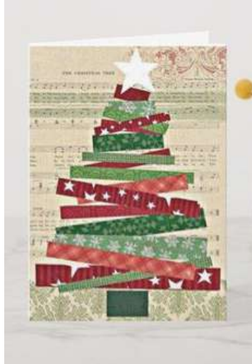
Collage Christmas Tree