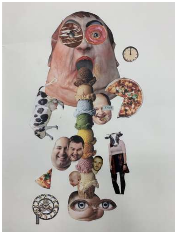
University of Wolverhampton workshop - December 2021

Lecturers from The University of Wolverhampton hosted a workshop with students where they created some interesting collage work.