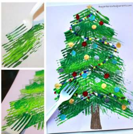
A Christmas Tree painted with a fork