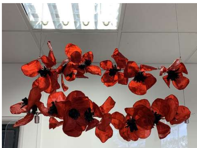
Remembrance Poppy installation - November 2021

Art enrichment students created a beautiful installation of wire and tissue paper poppies in senior school reception.