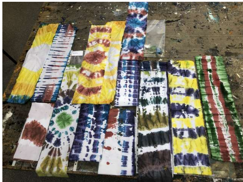
Art Club - Year 7 students that showed a keen interest in their art lessons were invited to a lunchtime art club, they were able to learn about processes that aren't taught as part of normal lessons.

Lecturers from The University of Wolverhampton hosted a workshop with students where they created some interesting collage work.