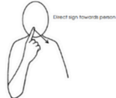
To Speak / To Talk