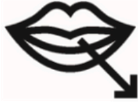
To Speak / To Talk