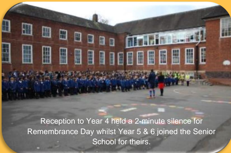
Reception to Year 4 held a 2-minute silence for Remembrance Day whilst Year 5 & 6 joined the Senior School for theirs.