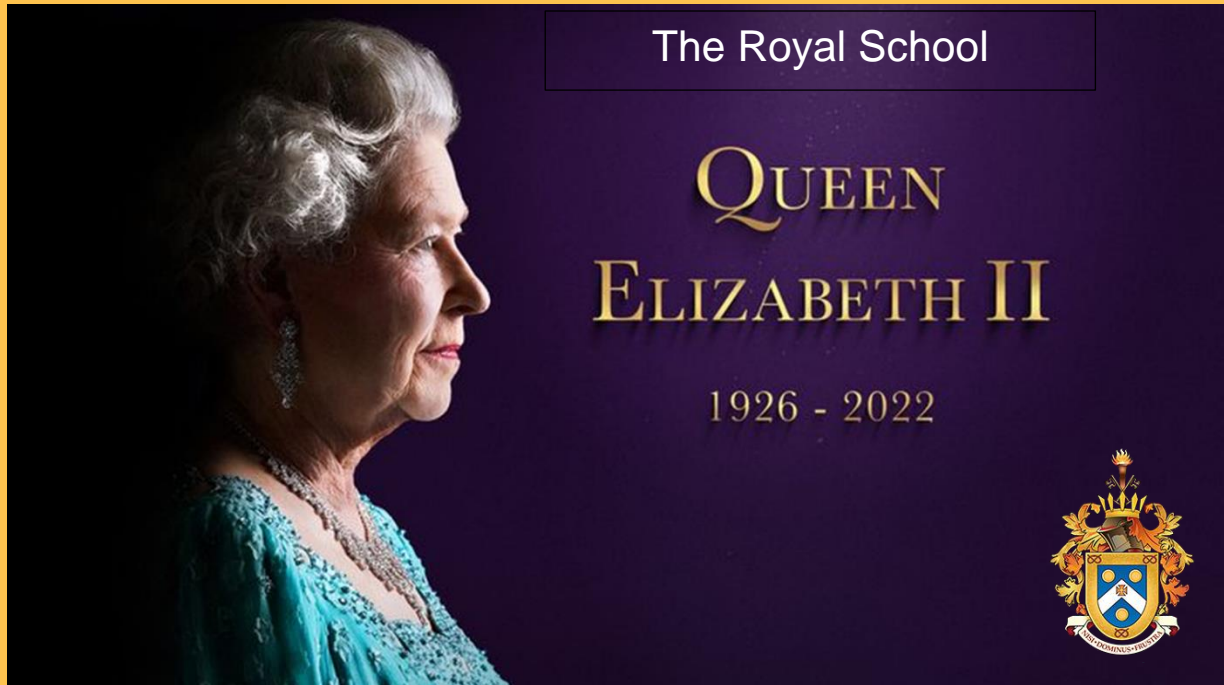
HM Queen Elizabeth II

The community of The Royal School Wolverhampton, our pupils, staff, governors and parents, are deeply saddened by the passing of Her Majesty Queen Elizabeth II. Our thoughts are with all members of the Royal Family at this time of sorrow. Her Majesty embodied many virtues and will always be remembered for her selfless and lifelong service, her warmth, and her gentle strength in leading the nation over seven decades. Her life was an example to us all and she was a constant source of unity and reassurance.