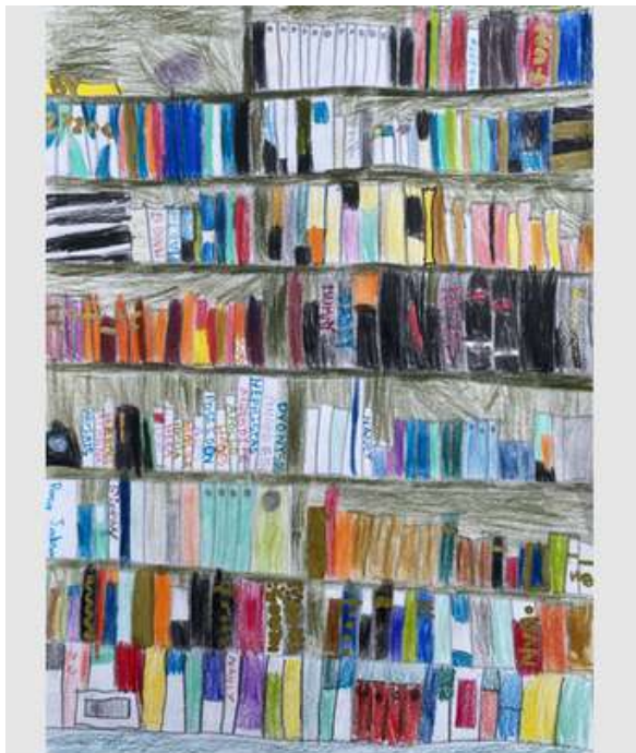
My Bookshelf at Home