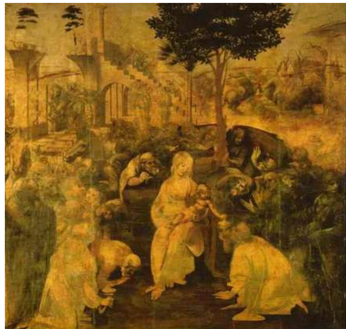
Adoration of the Magi by Leonardo Da Vinci (1481)