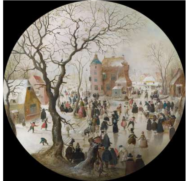
A Winter Scene with Skaters Near a Castle by Hendrick Avercamp (1608)