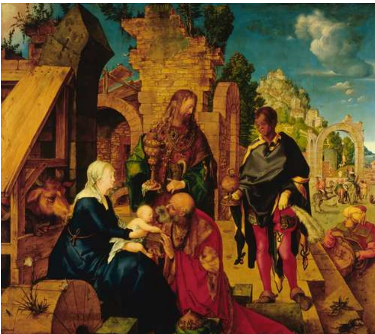
Adoration of the Magi by Albrecht Dürer (1504)