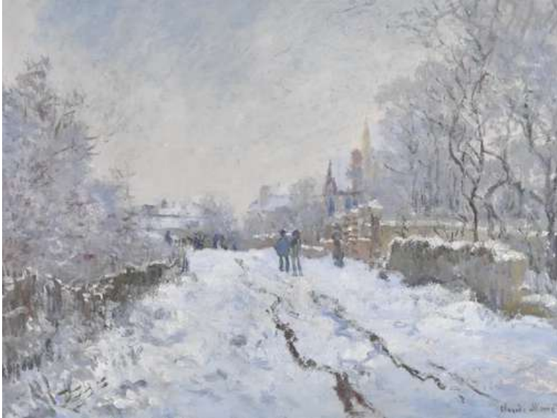
Snow Scene at Argenteuil by Claude Monet (1875)

There are more to look at on their website!